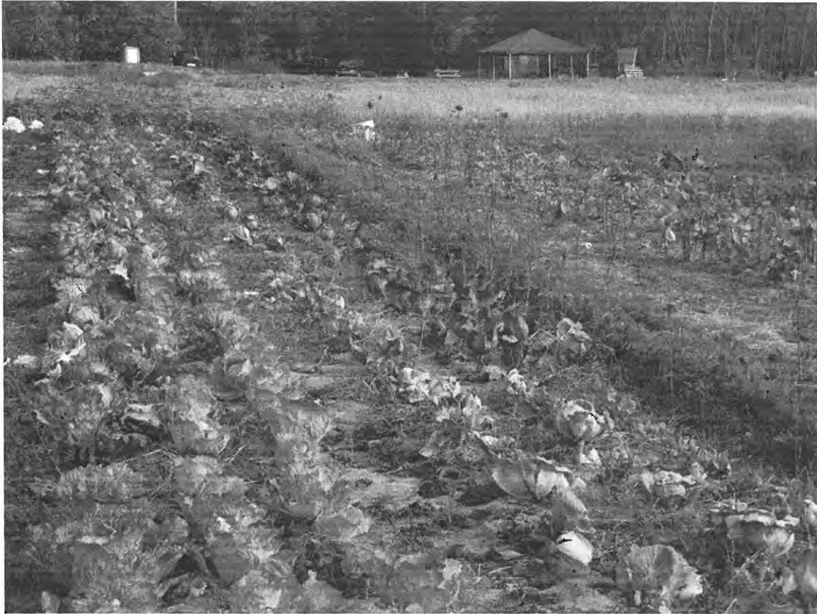
Cultivating Community Farm near Lisbon